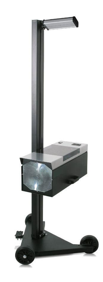
HL 200 D