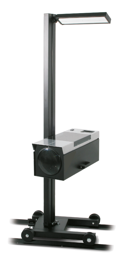
HL 200 D R