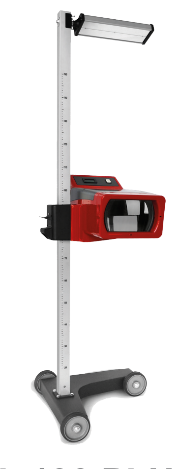
HL 190 PLUS D